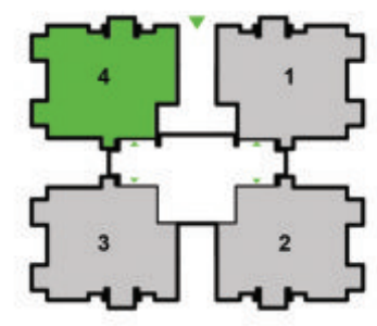
3 BHK UNIT 1890 SQ.FT. 3 BEDROOM 3 BATHROOM SERVANT'S ROOM