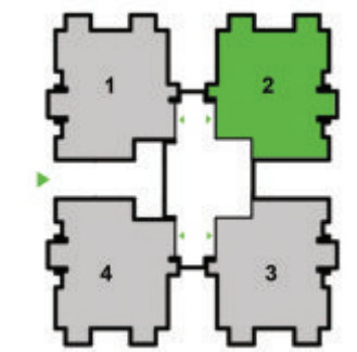
4 BHK UNIT 2390 SQ. FT. 4 BEDROOM 4 BATHROOM SERVANT'S ROOM